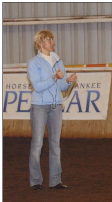
Olympic Medalist Ingrid Klimke